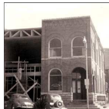
Museum building 1904

All Lake Chelan Chamber members are invited to the Chelan Museum Business After Hours. The event will include museum tours, refreshments, a little wine, door prizes and a opportunity to visit with the Chelan business community.